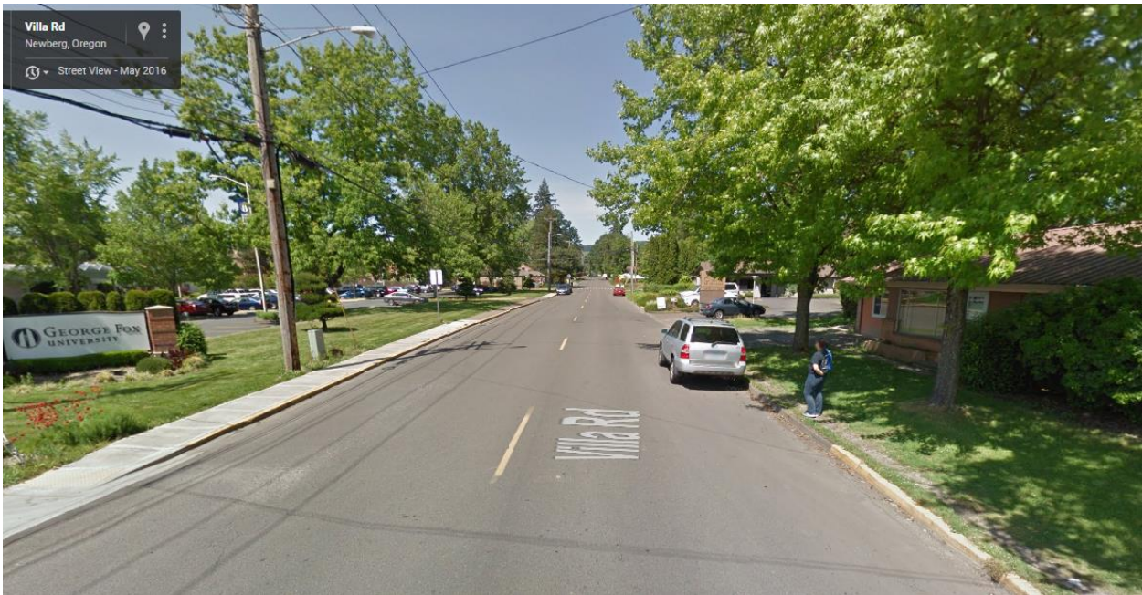
Figure 3 – Villa Road near Sherman St – Looking North