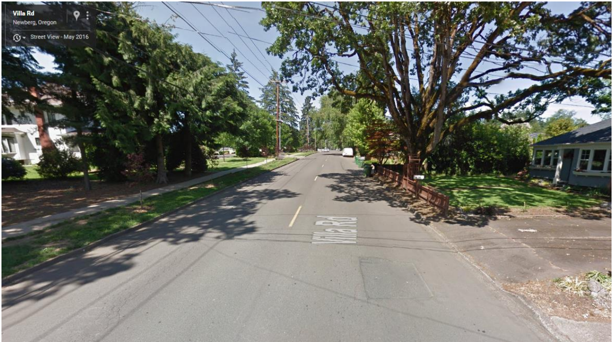
Figure 4 – Villa Road near North St – Looking North