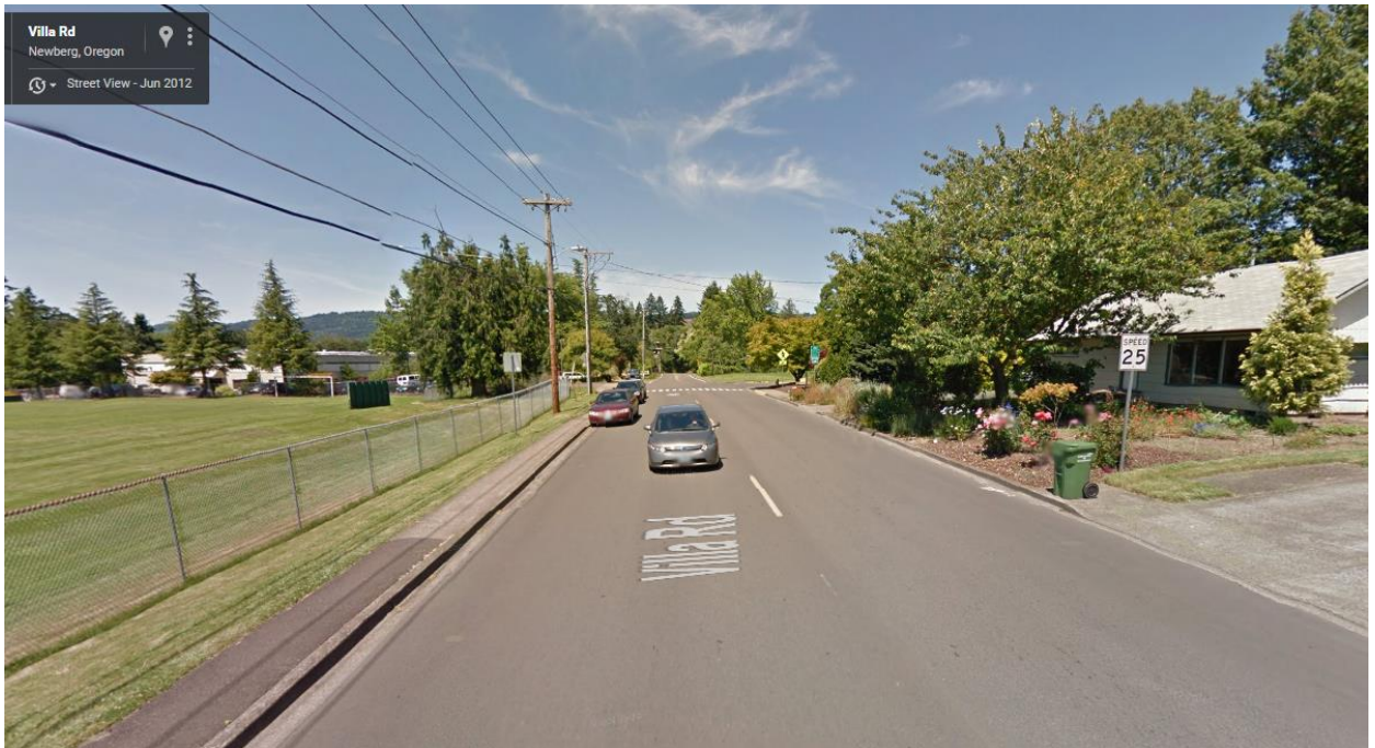
Figure 5 – Villa Road near Haworth Ave – Looking North

The Newberg Municipal Code authorizes the Traffic Safety Commission to decide on location of parking and all traffic control devices: