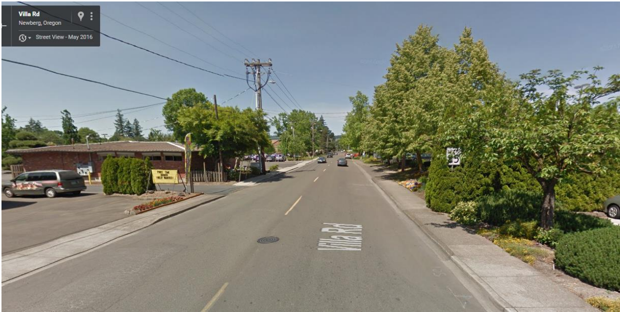
Figure 2 – Villa Road near HWY 99 – Looking North