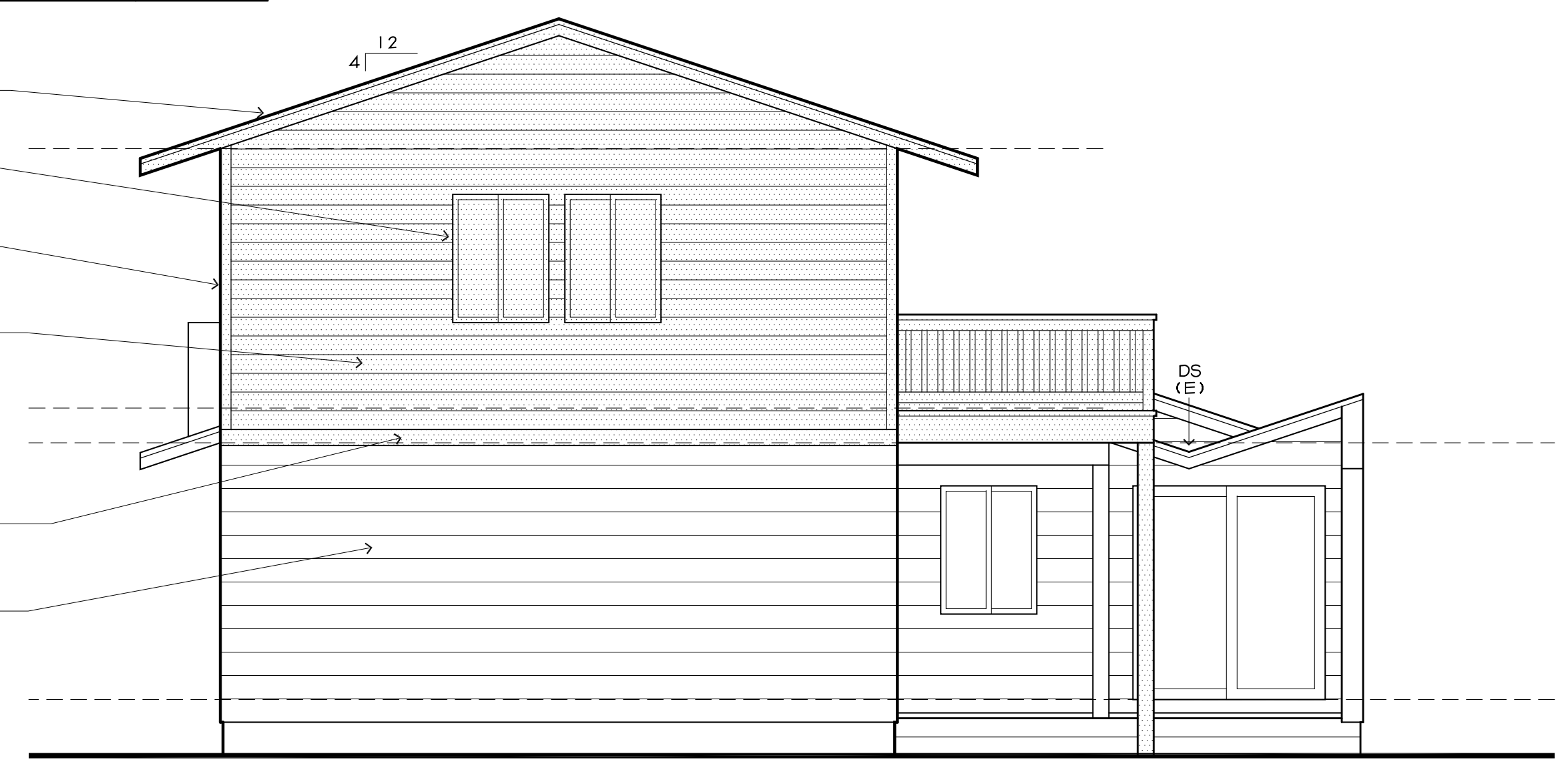
4 NORTH ELEVATION (RIGHT SIDE) SCALE: 1/4" = 1'-0"