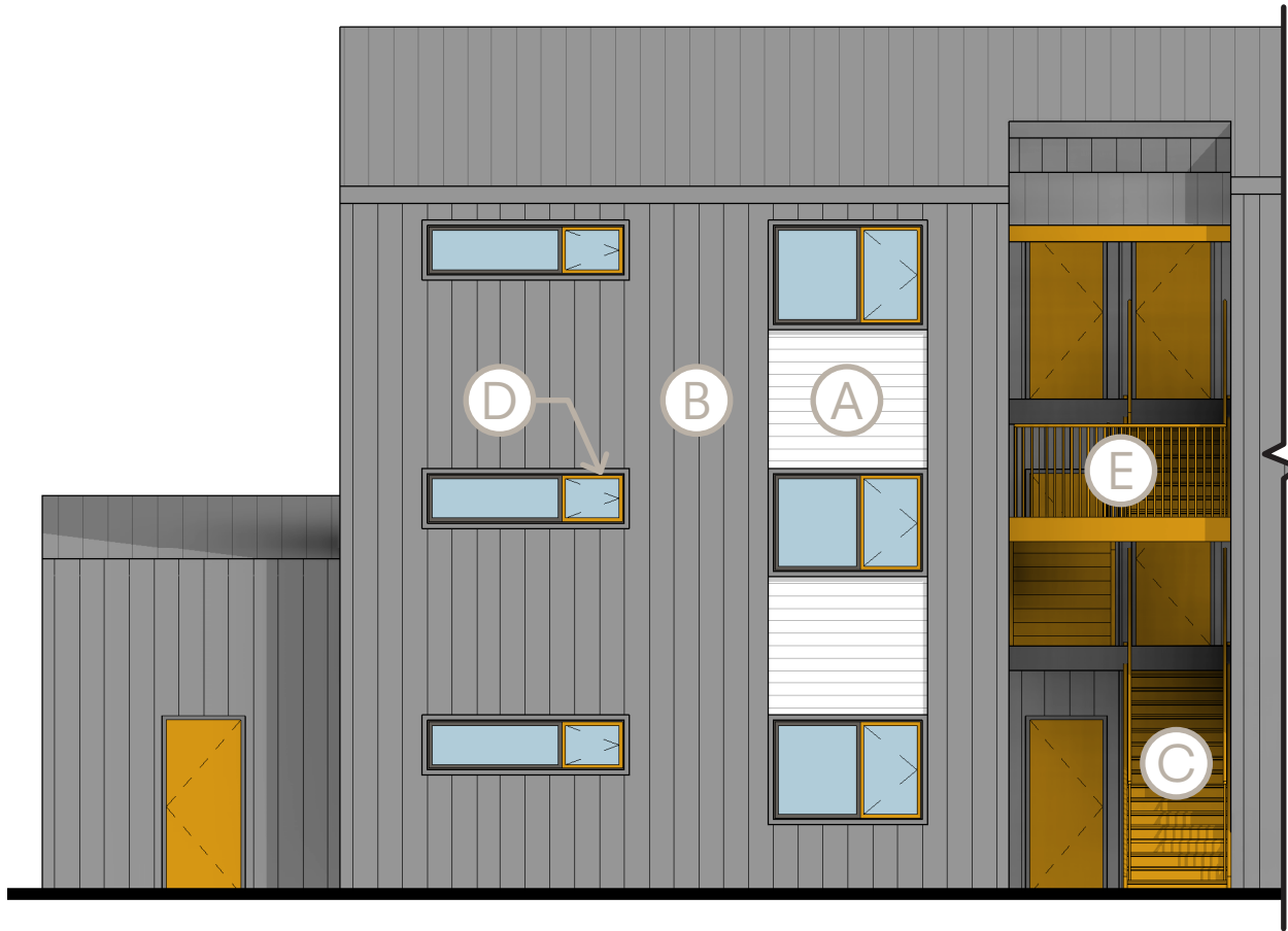
PARTIAL WEST ELEVATION