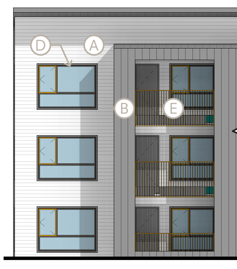
PARTIAL EAST ELEVATION