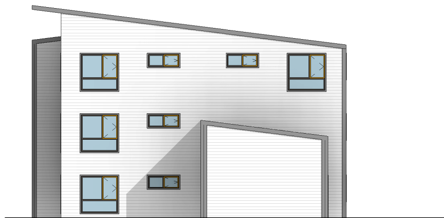
BUILDING B - NORTH ELEVATION