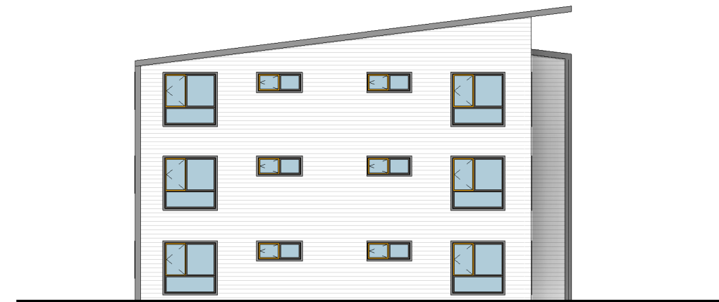
BUILDING B - SOUTH ELEVATION