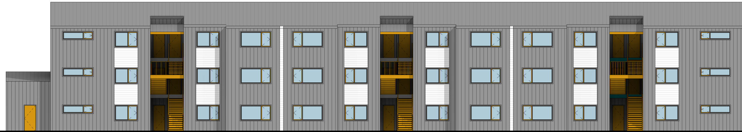
BUILDING B - WEST ELEVATION