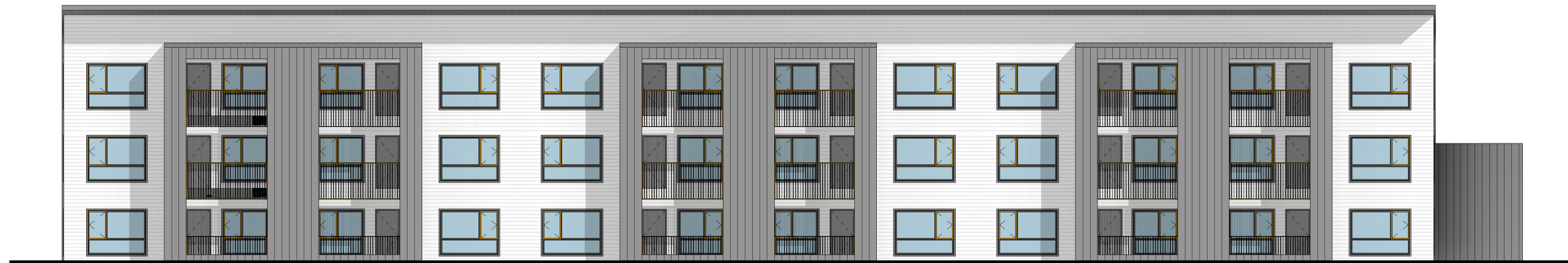
BUILDING B - EAST ELEVATION