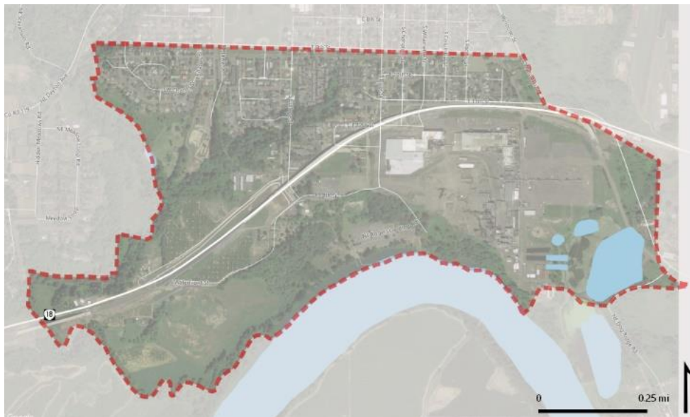
Figure 1. Riverfront Master Plan Study Area

The Riverfront study area is shown at left. It is located on the south side of Newberg, generally south of 9th Street. The study area is entirely within the City's Urban Growth Boundary (UGB).