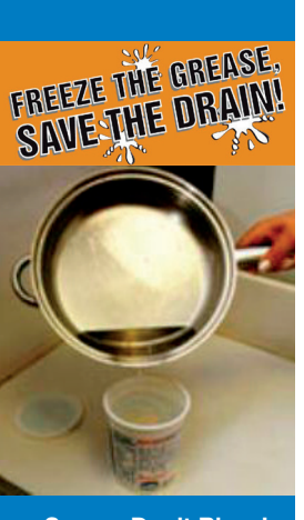
Scrape Don't Rinse!

Place COOLED cooking oil, meat and DAIRY Fats in sealed containers into the garbage.