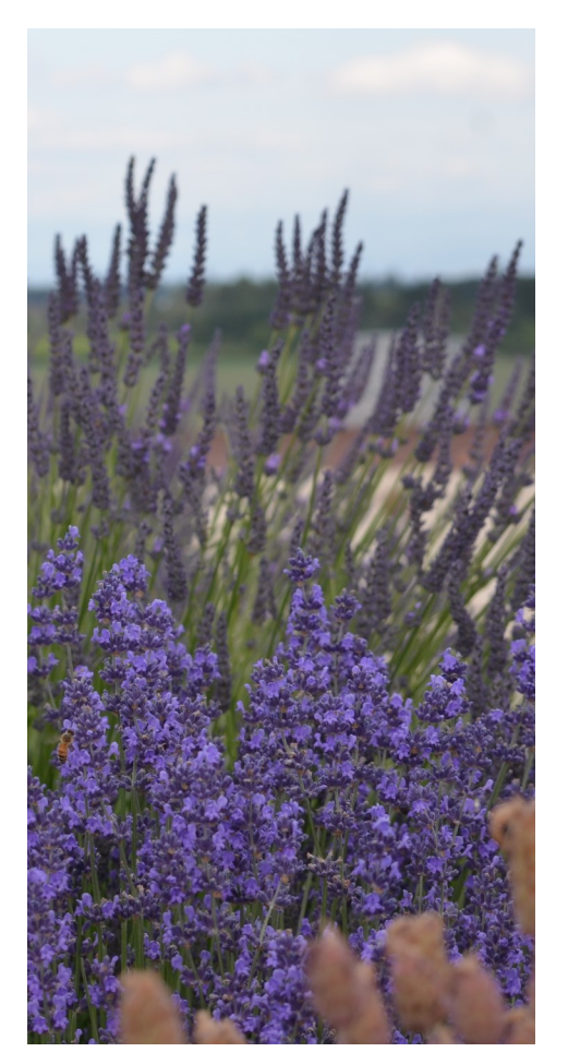
A lavender plant at a local lavender farm