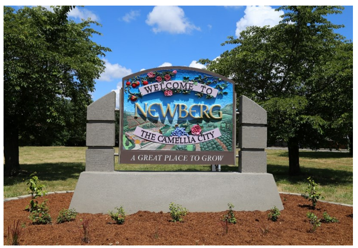
A photo of the Newberg Welcome Sign

A great chance to join the City of Newberg team in a leadership role.