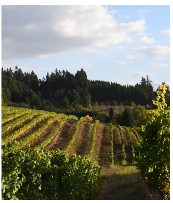
One of the dozens of local vineyards located in the Newberg area