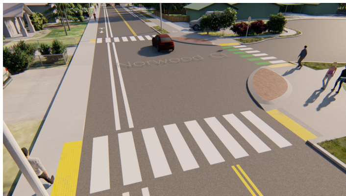
Simulation of future changes to Elliott Road. A video simulation can be viewed at the project website