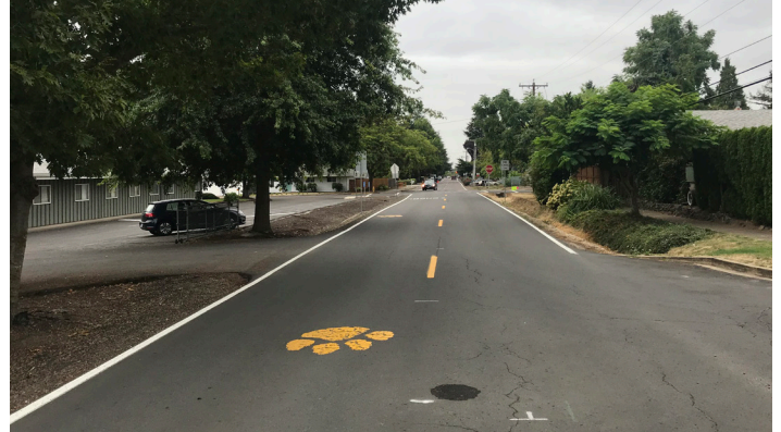
The existing road lacks continuous sidewalks to Newberg High School. The road lacks stormwater facilities and the pavement is in need of replacement.

Elliott Road is located at one of few traffic signals along OR 99W and is a vital north - south connection in Newberg. It provides direct access to Newberg High School's south entrance, and links to Mabel Rush Elementary, the Chehalem Aquatic and Fitness Center, to nearby churches, and homes. Elliott Road is a community connection for residents south of OR 99W and a high priority in the Transportation System Plan. The City is making changes that create a safer route for all users.