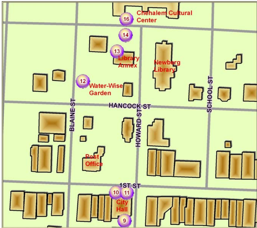
Newberg Downtown Core, City Properties with Camellias:

24– Memorial Park (near the gazebo), Camellia sasanqua ‘ Kunasaka ’ Bloom color: pinks Address: 305 S Howard St. Bloom time: Middle to Late