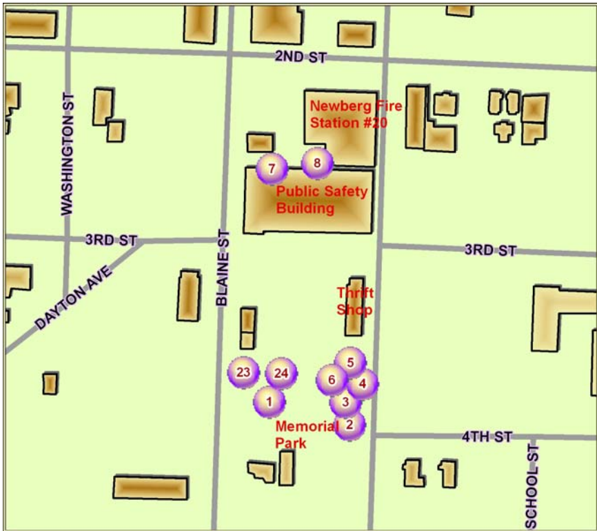
Memorial Park Vicinity, City Properties with Camellias:

1 – Memorial Park (at the gazebo), Camellia sasanqua ‘ White Doves ’ Bloom color: sparkling white Address: 305 S Howard St. Bloom time: Early