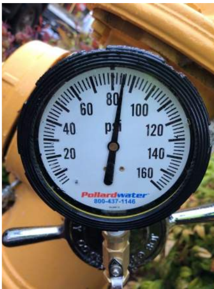
Static pressure on gauge hydrant located in front of 1013 N Center Street.

Project: 3199 Friendsview Date: April 27th, 2020, 8:10 a.m. Creator: Waylon Knight