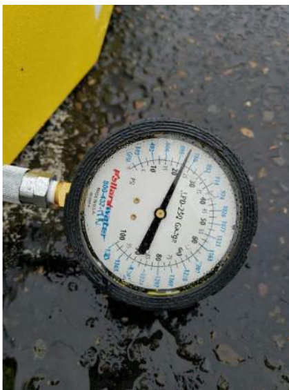
Pitot reading with dechlor diffuser on flowed hydrant located on Fulton Street and East Cherry Street

Project: 3199 Friendsview Date: April 27th, 2020, 8:13 a.m. Creator: Waylon Knight