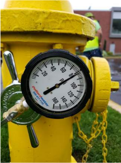
Residual pressure on flowed hydrant at intersection of Fulton Street and East Cherry Street

Project: 3199 Friendsview Date: April 27th, 2020, 8:14 a.m. Creator: Brent Whittaker