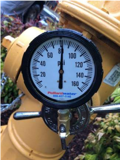
Residual Pressure on guage hydrant in front of 1013 N Center Street

Project: 3199 Friendsview Date: April 27th, 2020, 8:14 a.m. Creator: Brent Whittaker