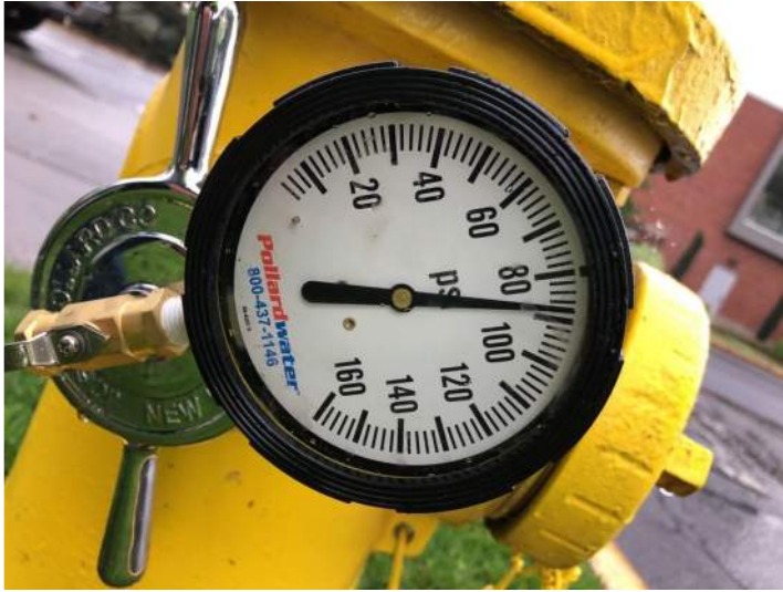
Static pressure on flowed hydrant at intersection of Fulton Street and East Cherry Street

Project: 3199 Friendsview Date: April 27th, 2020, 8:10 a.m. Creator: Waylon Knight