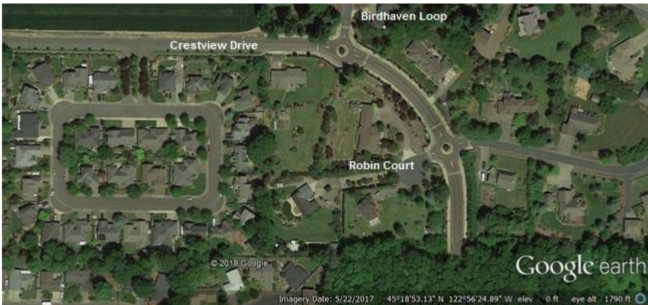
Figure 2. Traffic Calming Treatments along Crestview Drive

As shown in Figure 1, Crestview Drive, from Birdhaven Loop to the northern edge of Crestview Crossing, was reconstructed in 2011/2012 to include two intersection traffic calming traffic circles on Crestview Drive at Birdhaven Loop and Robin Court, depicted in Figure 2 below.