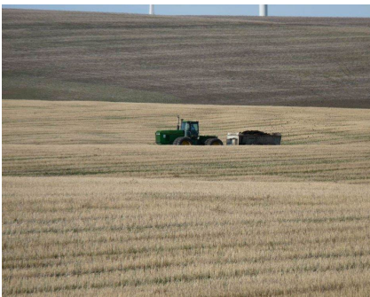
Land application of biosolids on farm fields in eastern Oregon.

The Oregon Department of Environmental Quality (DEQ) and United States Environmental Protection Agency (EPA) regulations require biosolids to undergo monitored treatment processes to kill and control pathogens and other disease-causing organisms before leaving wastewater treatment facilities. Biosolids are regularly tested for certain pollutants to meet safe level limits to protect human health and the environment.