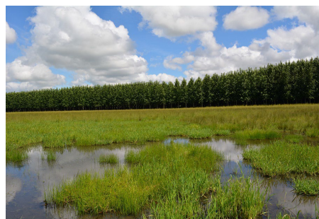
Biocycle Farm Poplar Plantation—Eugene-Springfield MWWC

Properly managed biosolids do not pollute surface water or groundwater. Biosolids land application programs permitted by DEQ require best management practices to ensure water quality is protected. In fact, documented improvements in surrounding water quality have been found in numerous biosolids application projects due to enriched soils and vigorous growth of vegetation that reduce soil erosion and stabilize contaminants that had previously contributed to stream and groundwater pollution (DEQ, 2018). Biosolids are not allowed to runoff into surface water (e.g., rivers, streams, ponds). Application rates for biosolids and site management practices are designed to prevent the leaching of nutrients to groundwater.